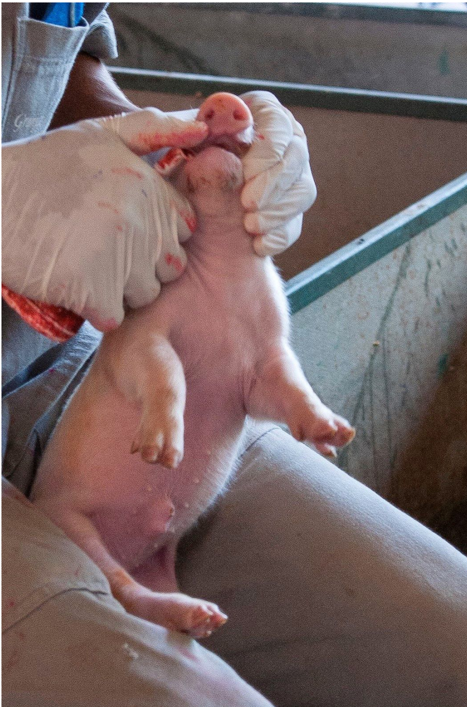
Photo: This young piglet is having its teeth clipped on a farm in Brazil.

Though once preferred to reduce risk of teeth splitting and infection, teeth grinding usually takes longer, increasing the handling time and stress response of piglets. A scientific review concludes that the perceived benefits of teeth reduction do not outweigh the costs from risks of injury and infection from the procedure itself 90-99 . Litters requiring teeth reduction due to poor sow colostrum and/or milk production, mastitis or competition for udder access are unlikely to perform well, regardless of the procedure.