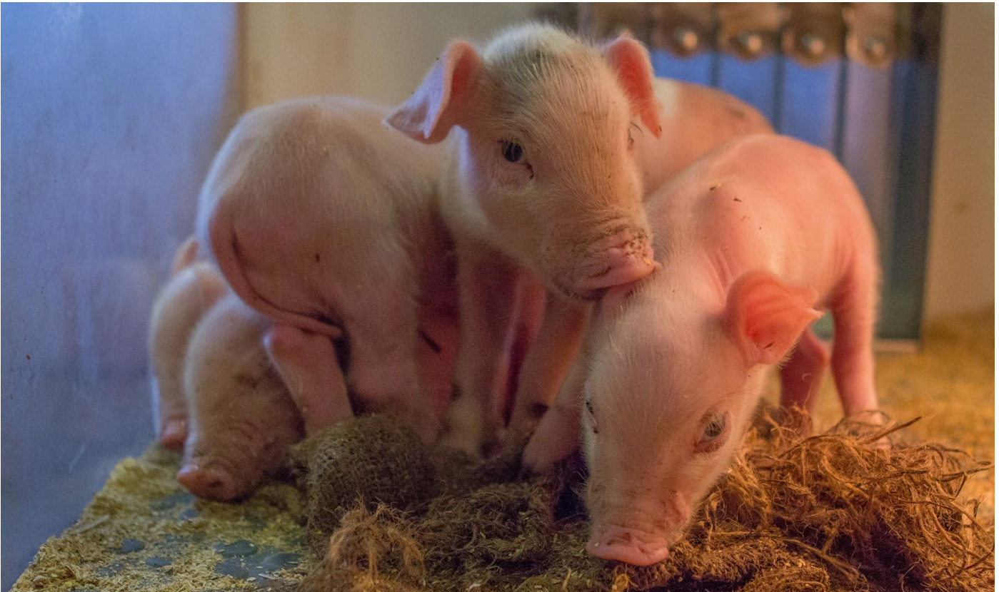
Photo: Sows during birthing and nursing, are out of cages, free to move and bond with their piglets with plenty of space, and straw.