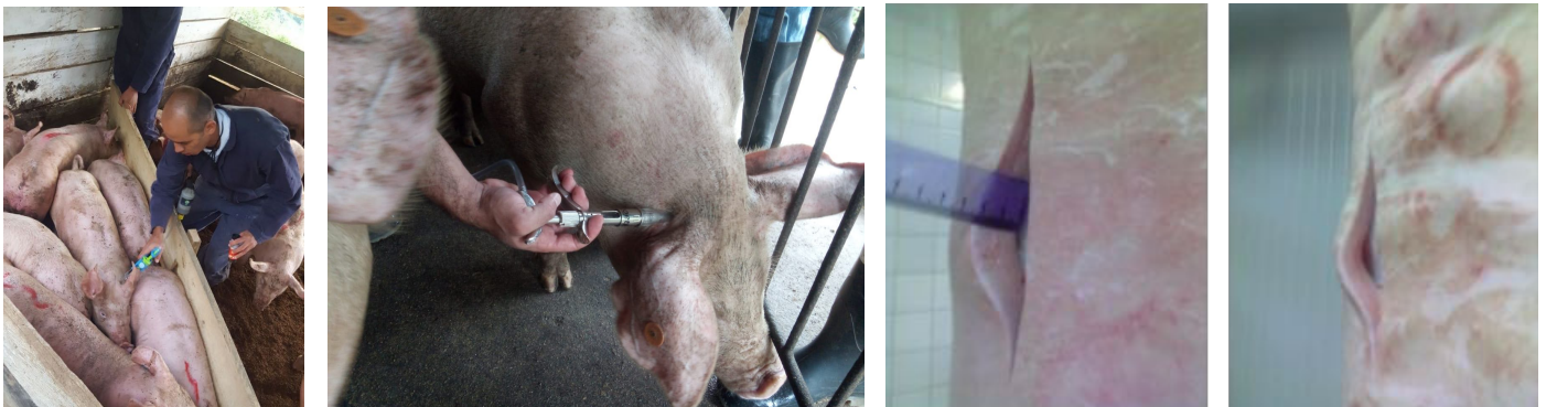
Photos: (lt) ALIAR S.A. trained staff vaccinating pigs. (Rt) IC pigs had an additional daily weight gain of 54g and finished with at least 2.8mm less backfat and 2.2% more lean 13 . Innosure is the Colombian registered name of the vaccination format by Zoetis

Argentina and Mexico are also increasingly adopting immunocastration.