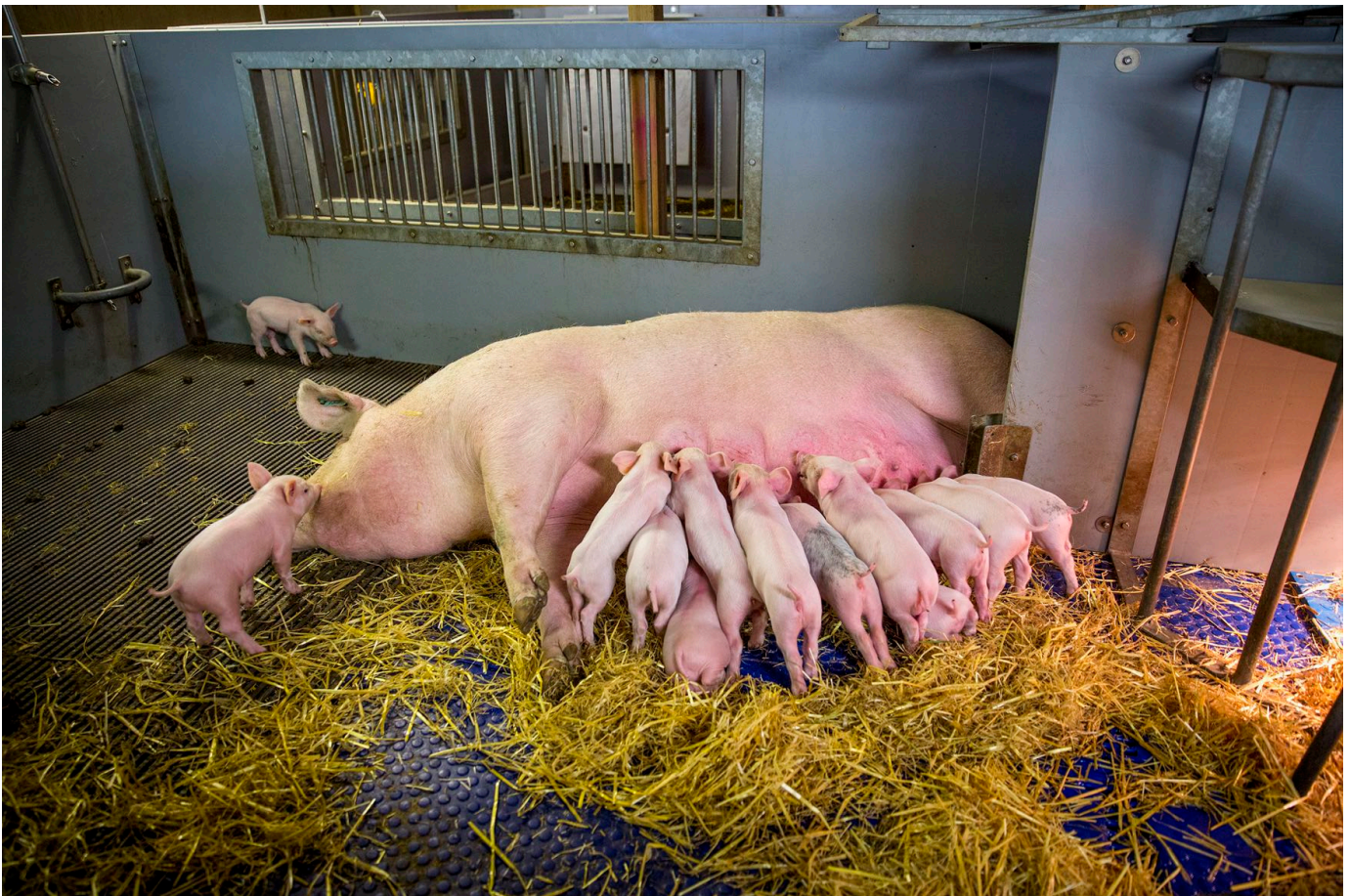
Photo: Sows in free farrowing systems produce more milk which also supports later weaning and more robust piglets.