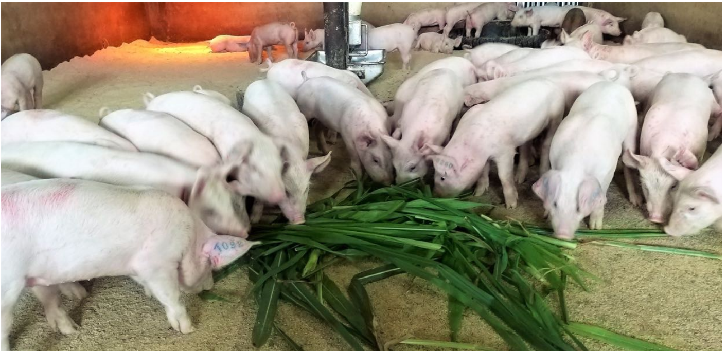
Photo: Betagro long tail weaners rooting in the sawdust and using enrichment.

These workers anecdotally report: "Fifty percent less fighting and minimal tail biting. So, with enrichment we know we can send more pigs to slaughter."