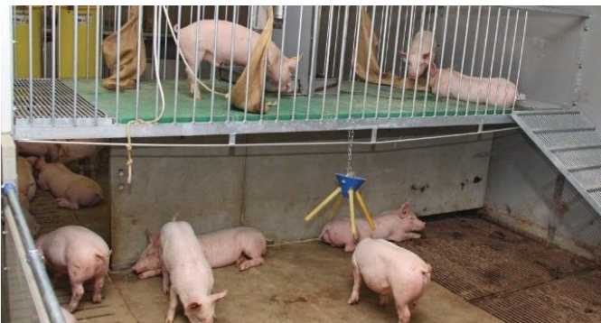
Photos: Balcony examples in the Netherlands.

These innovative housing systems may become increasingly relevant as the EU continues to review space requirements for pigs or further enforces the avoidance of routine tail docking. Elsewhere, they may simply be more cost effective and enable a more sustainable, higher welfare form of production and pork products, where later weaning is feasible and painful procedures can be avoided.