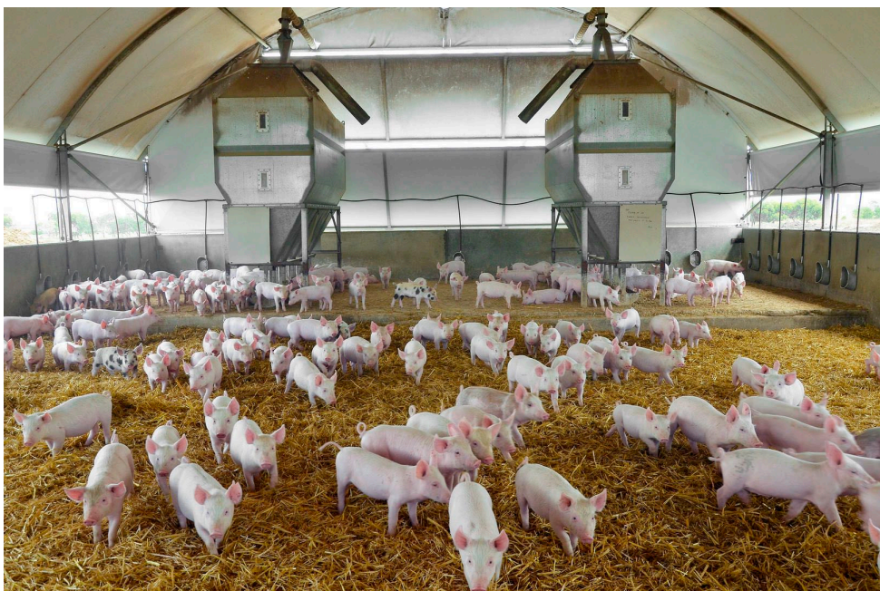
Photo: Ecoshelters are now a well-established, cost-effective housing system. They are used to raise around 36% 29 of grower/finisher herds in Australia and are used by some major producers. However, in the late 1990s, the Croaghs pioneered raising weaners to finishers, entirely in ecoshelters.

Their pigs are provided with additional straw bales at the start of weaning (like Niman Ranch farm photo below) to eat and play with, and they retreat behind them to diffuse any fighting. In winter the weaners are sometimes completely burrowed under the straw, while summer has its own challenges. Enough drinkers and feeders are essential to avoid competition and heat stress, plus ventilation. Side curtains can also be raised and lowered. Additional hosing may be needed during temperatures of more than 35C. Also key to the farm’s success has been careful training of staff about pig behaviour. Staff must hold at least a minimum certificate in pig husbandry.