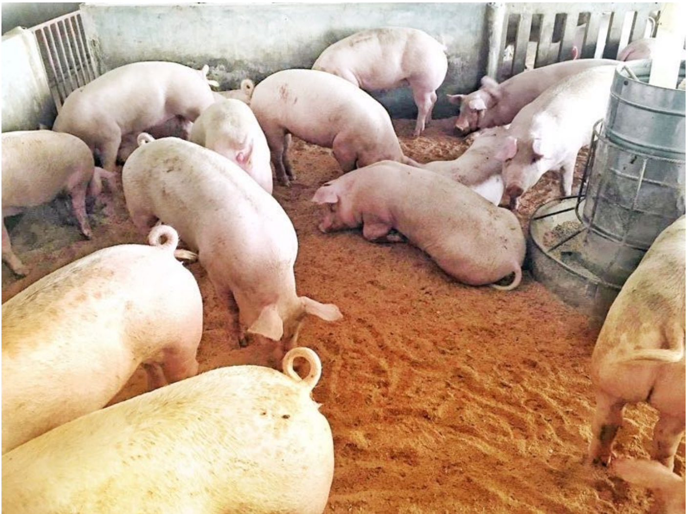
Photo: Betagro long tail finishers rooting in sawdust provided.

"We use monthly meetings and videos to demonstrate the benefits to the (contract) farmers, pigs and production (from trials on company farms). We communicate with management - that it is easier with fewer sick pigs or pigs with tail biting to treat, less use of antibiotics, and less time for these activities needed."